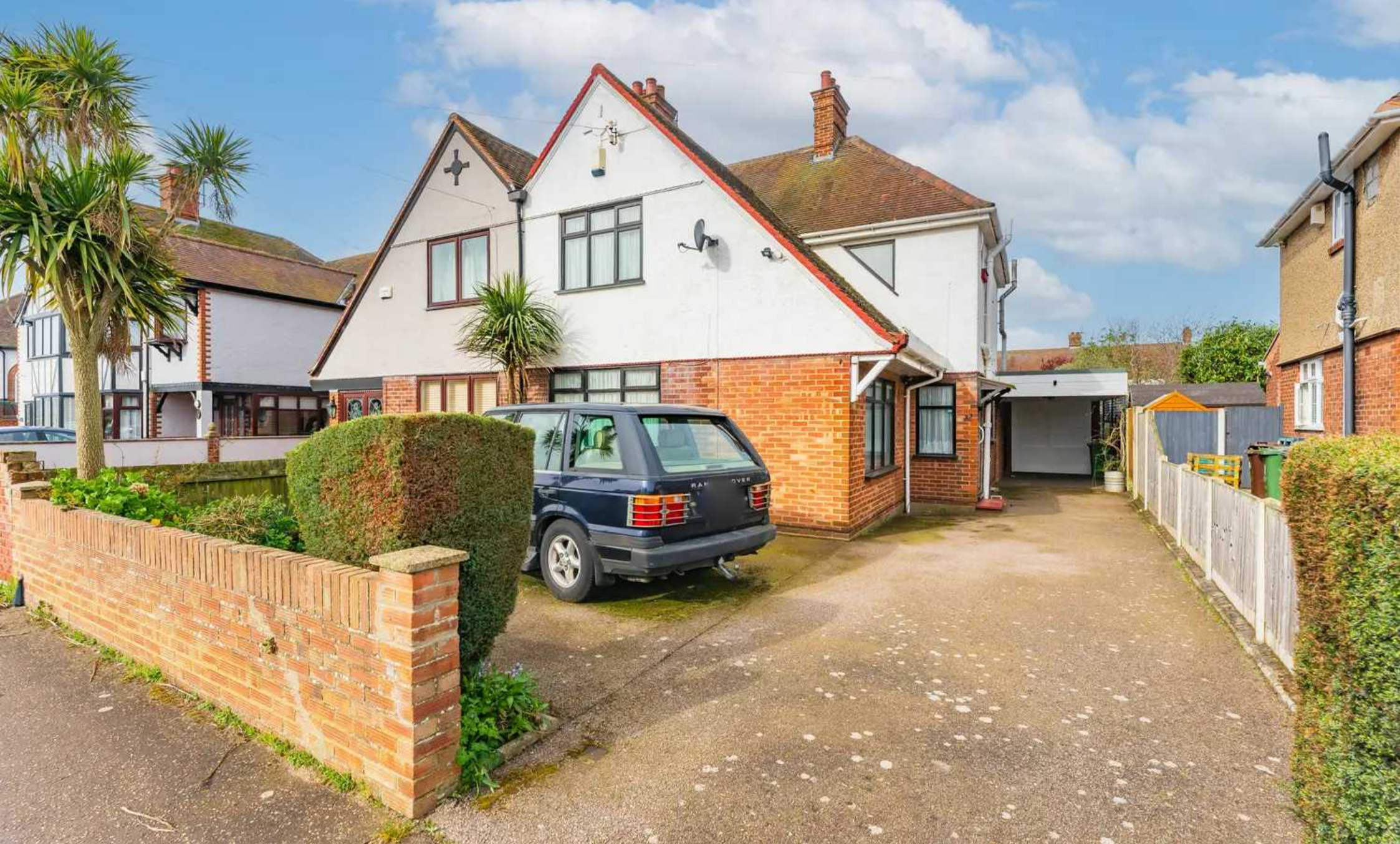
33 Collingwood Road, Great Yarmouth