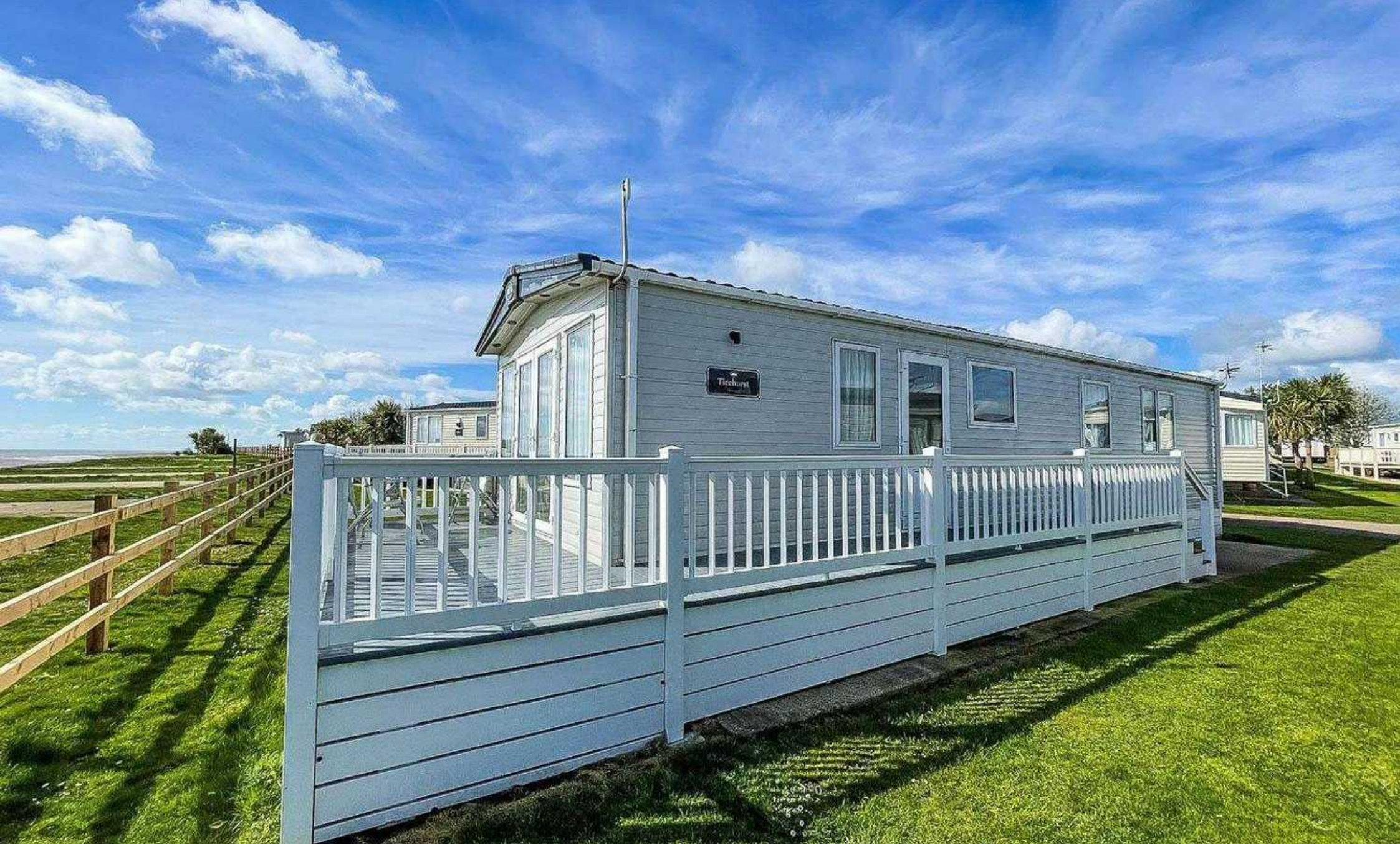
Arbor Lane, Pakefield