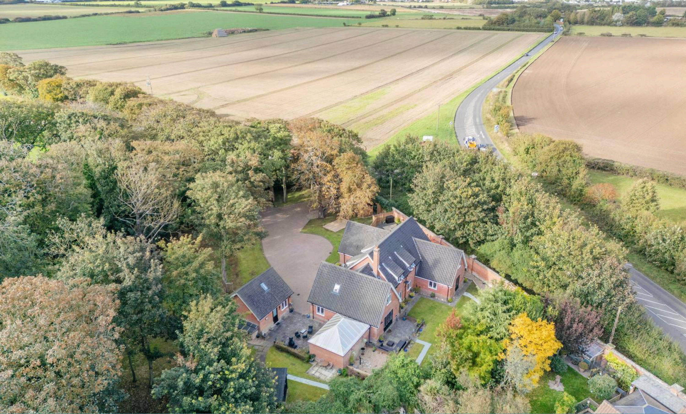
Woodlands Scrathby Road, Scrathby £950,000