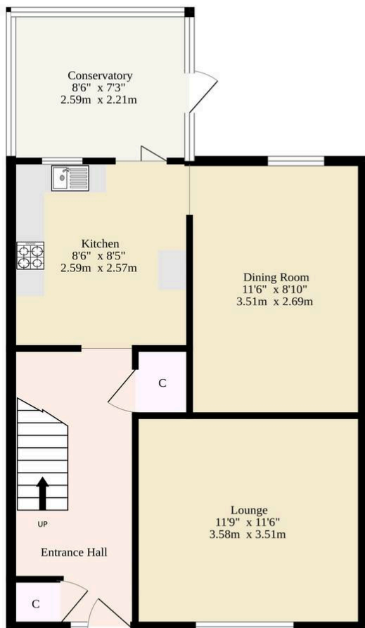
Ground Floor 460 sq.ft. (42.7 sq.m.) approx.