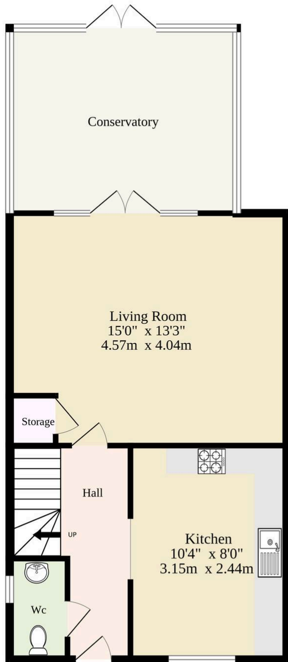
Ground Floor 283 sq.ft. (26.3 sq.m.) approx.