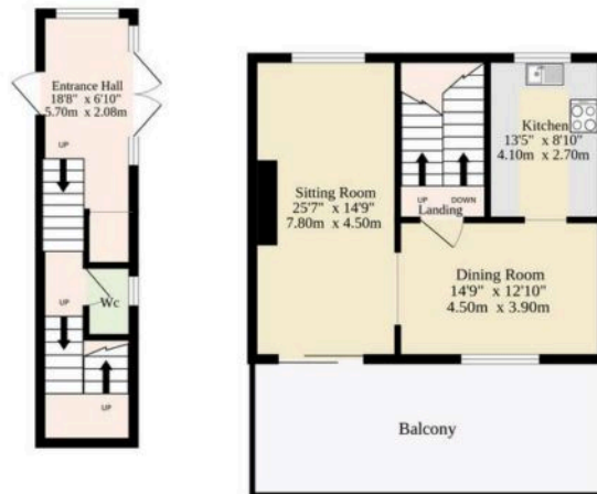
1st Floor 723 sq.ft. (67.2 sq.m.) approx.