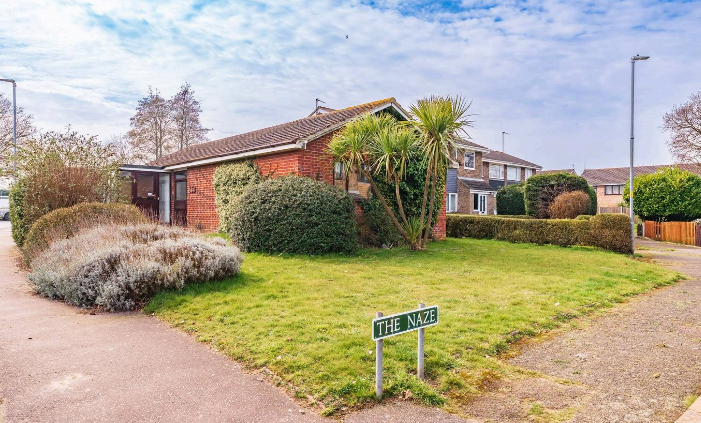
11 The Naze, Belton £230,000