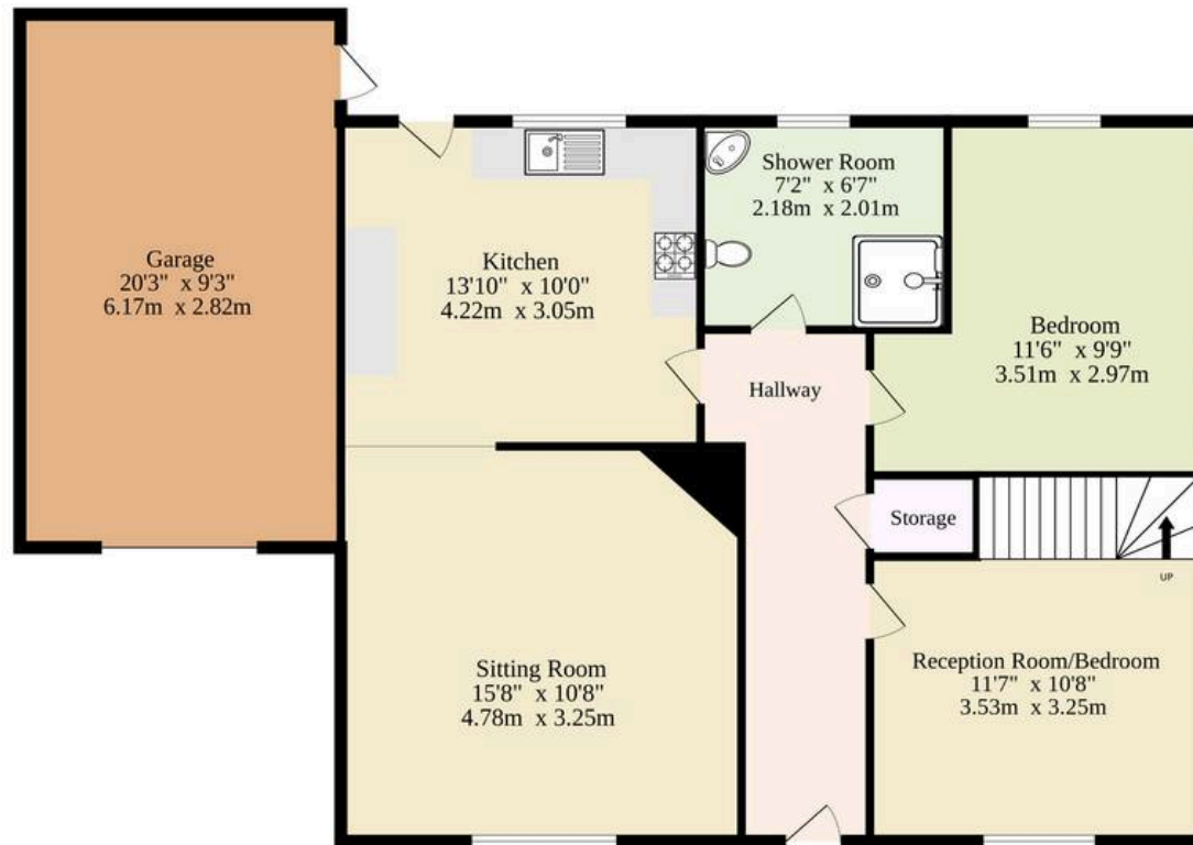
Ground Floor 881 sq.ft. (81.8 sq.m.) approx.