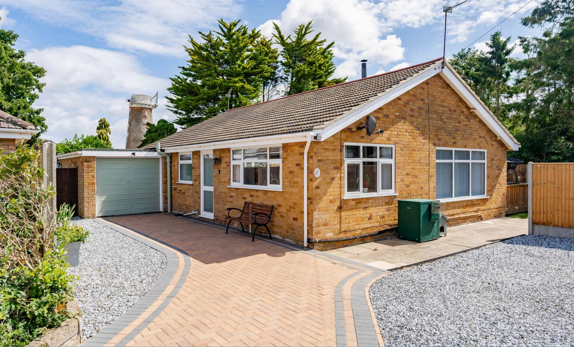
12 Broadlands Road, Hickling £395,000