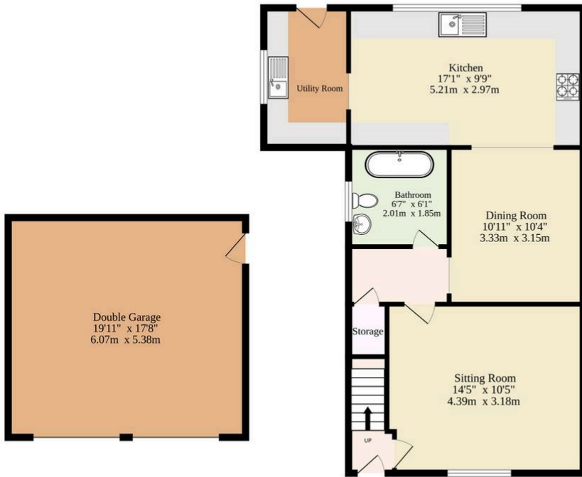
Ground Floor 947 sq.ft. (88.0 sq.m.) approx.