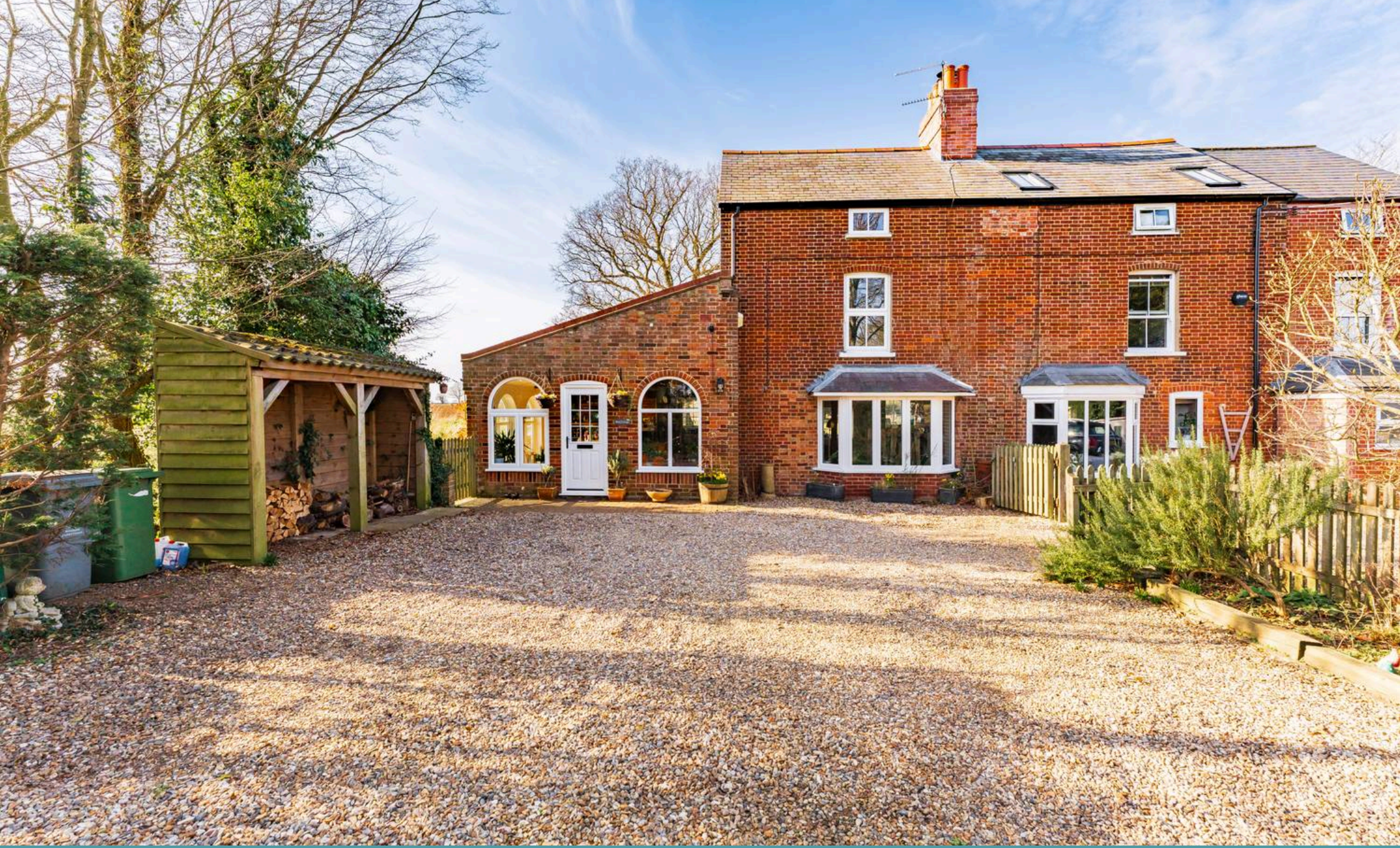
West Cottage South Walsham Road, Panxworth £465,000