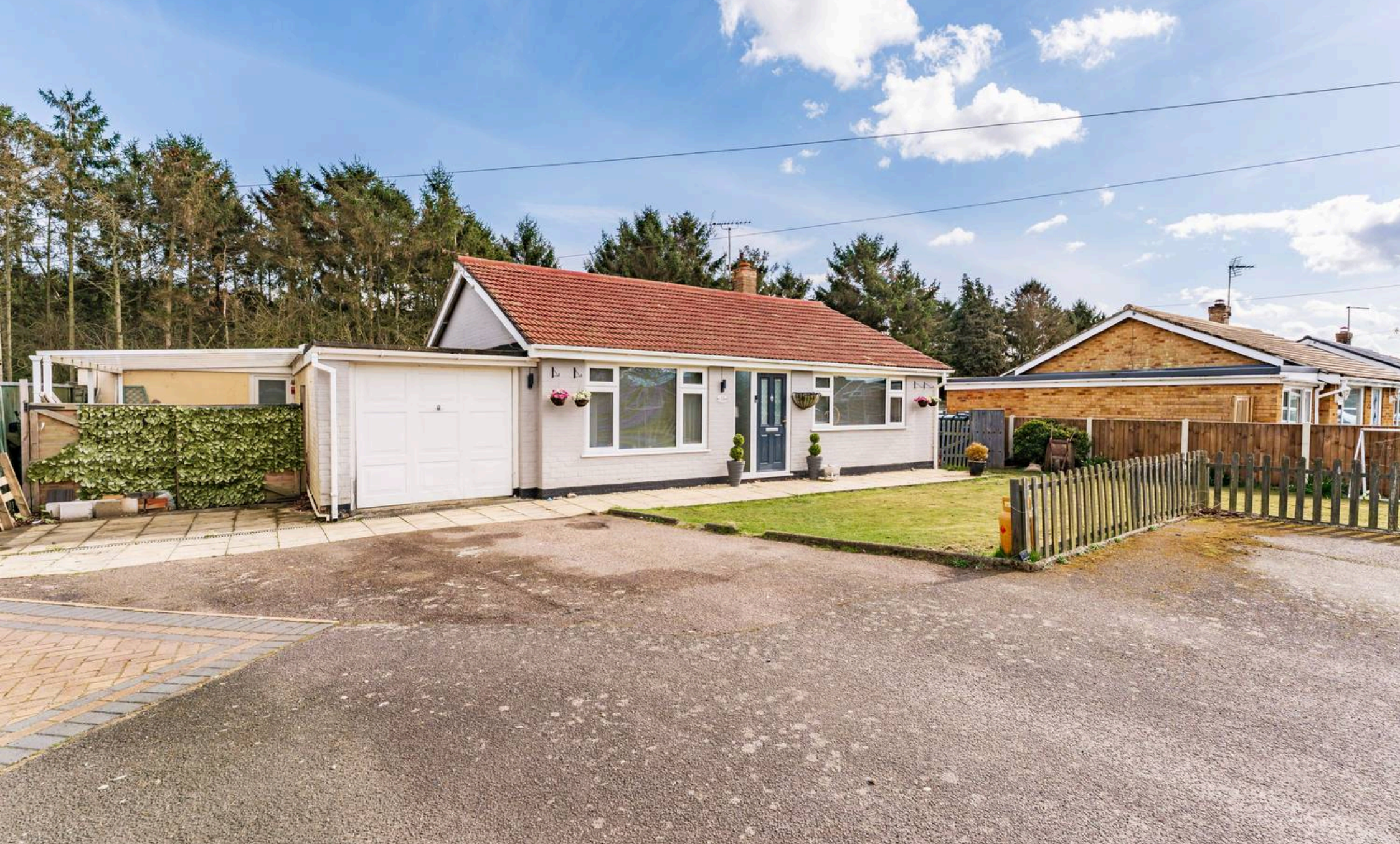
13 Broadlands Road, Hickling £350,000