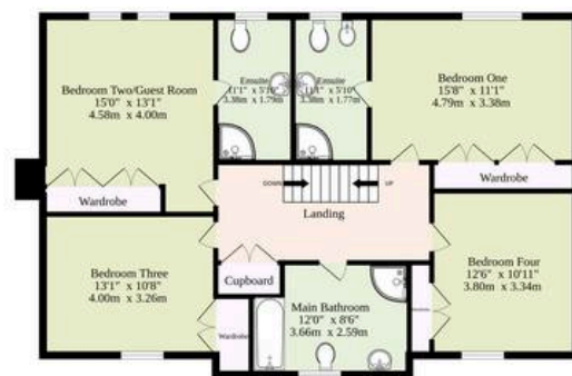
1st Floor 506 sq.ft. (46.9 sq.m.) approx.