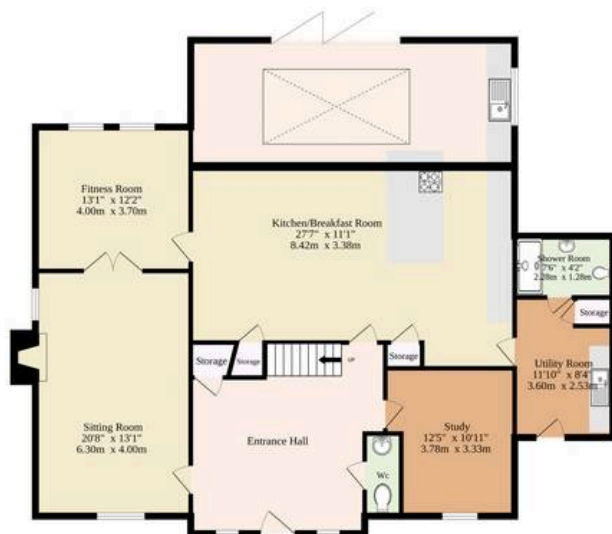
Ground Floor 1485 sq.ft. (140.3 sq.m.) approx.