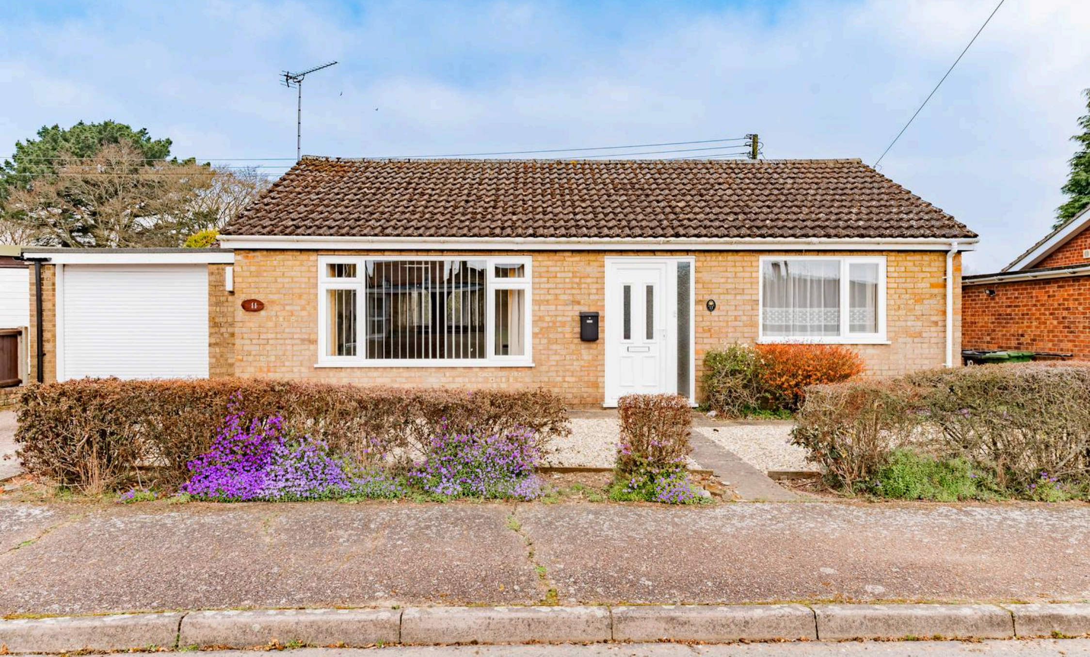
11 Nelson Close, Bradenham £230,000