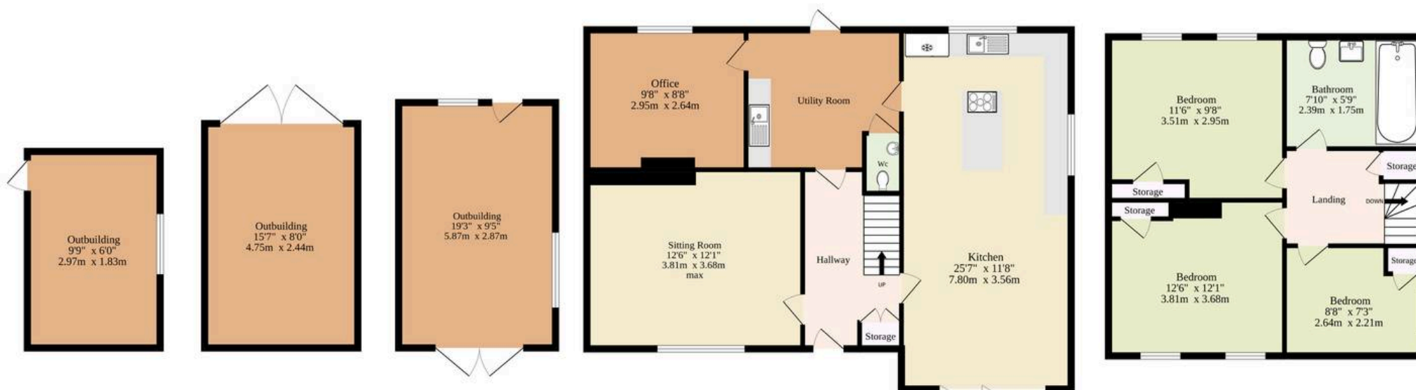
1st Floor 395 sq.ft. (36.7 sq.m.) approx.

TOTAL FLOOR AREA : 1458 sq.ft. (135.5 sq.m.) approx.