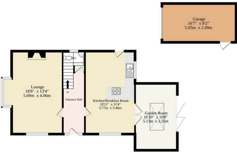
Ground Floor 800 sq.ft. (74.3 sq.m.) approx.