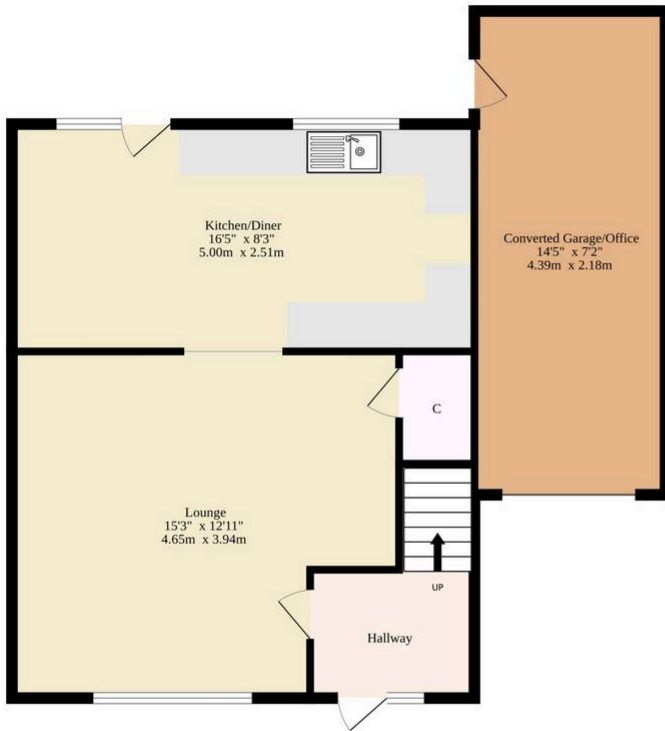
Ground Floor 460 sq.ft. (42.7 sq.m.) approx.