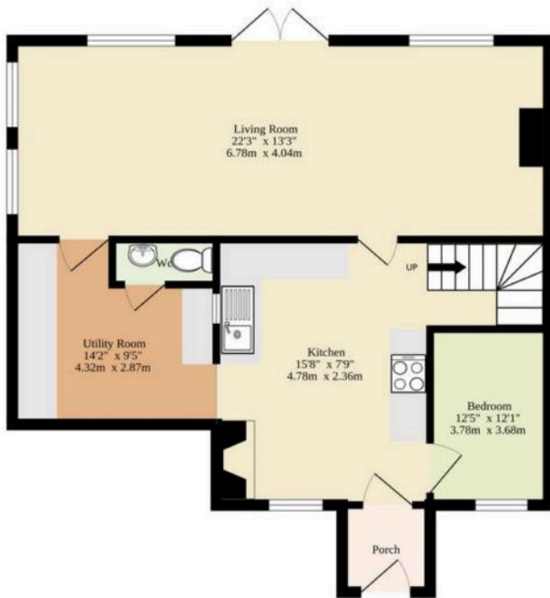
Ground Floor 920 sq.ft. (85.5 sq.m.) approx.