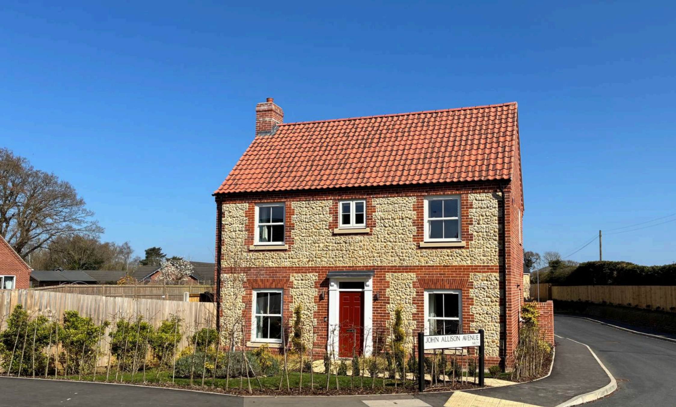
Plot 1 - The Roxham John Allison Avenue, Holt £490,000