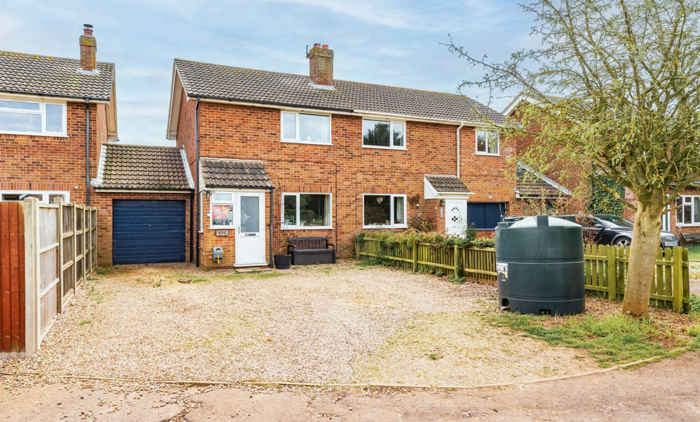
125 Broadgate Close, Northrepps £220,000