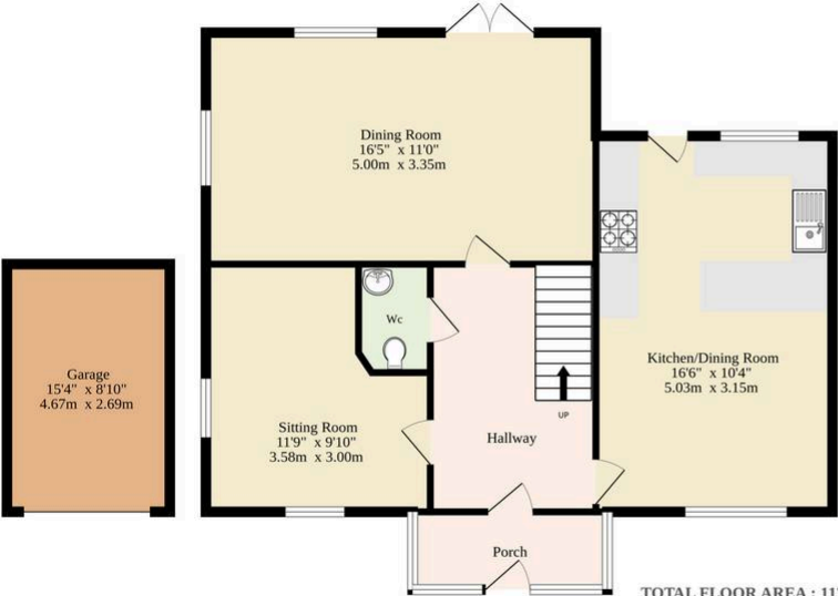
Ground Floor 669 sq.ft. (62.2 sq.m.) approx.