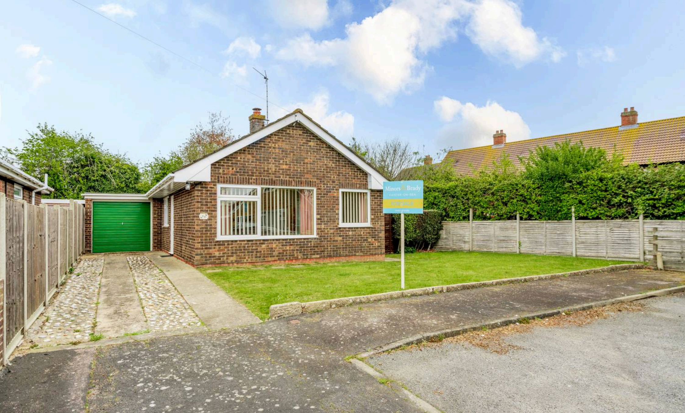
15 Springfield North, Hemsby £300,000