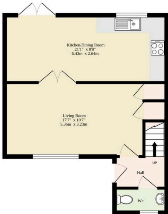
Ground Floor 419 sq.ft. (38.9 sq.m.) approx.