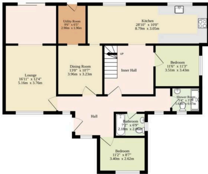
Ground Floor 1350 sq.ft. (125.4 sq.m.) approx.