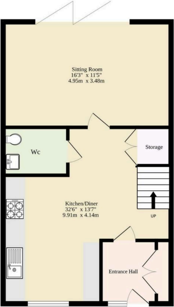
Ground Floor 723 sq.ft. (67.2 sq.m.) approx.