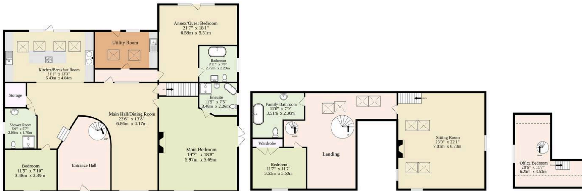
2nd Floor 241 sq.ft. (22.4 sq.m.) approx.

TOTAL FLOOR AREA : 3082 sq.ft. (286.3 sq.m.) approx.