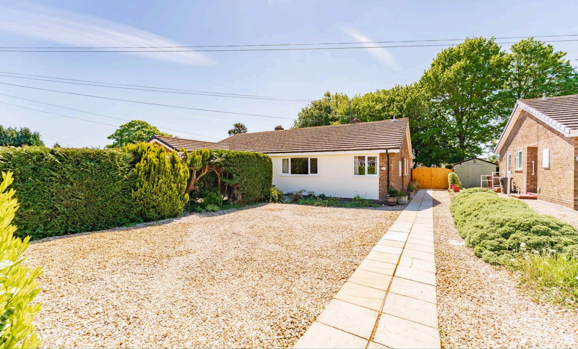
13 Tipton Close, Dereham £285,000