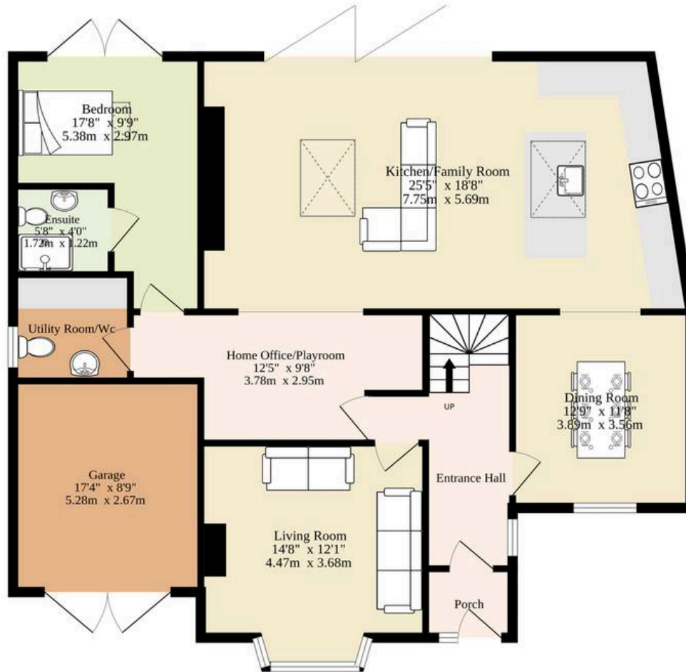
Ground Floor 1416 sq.ft. (131.6 sq.m.) approx.