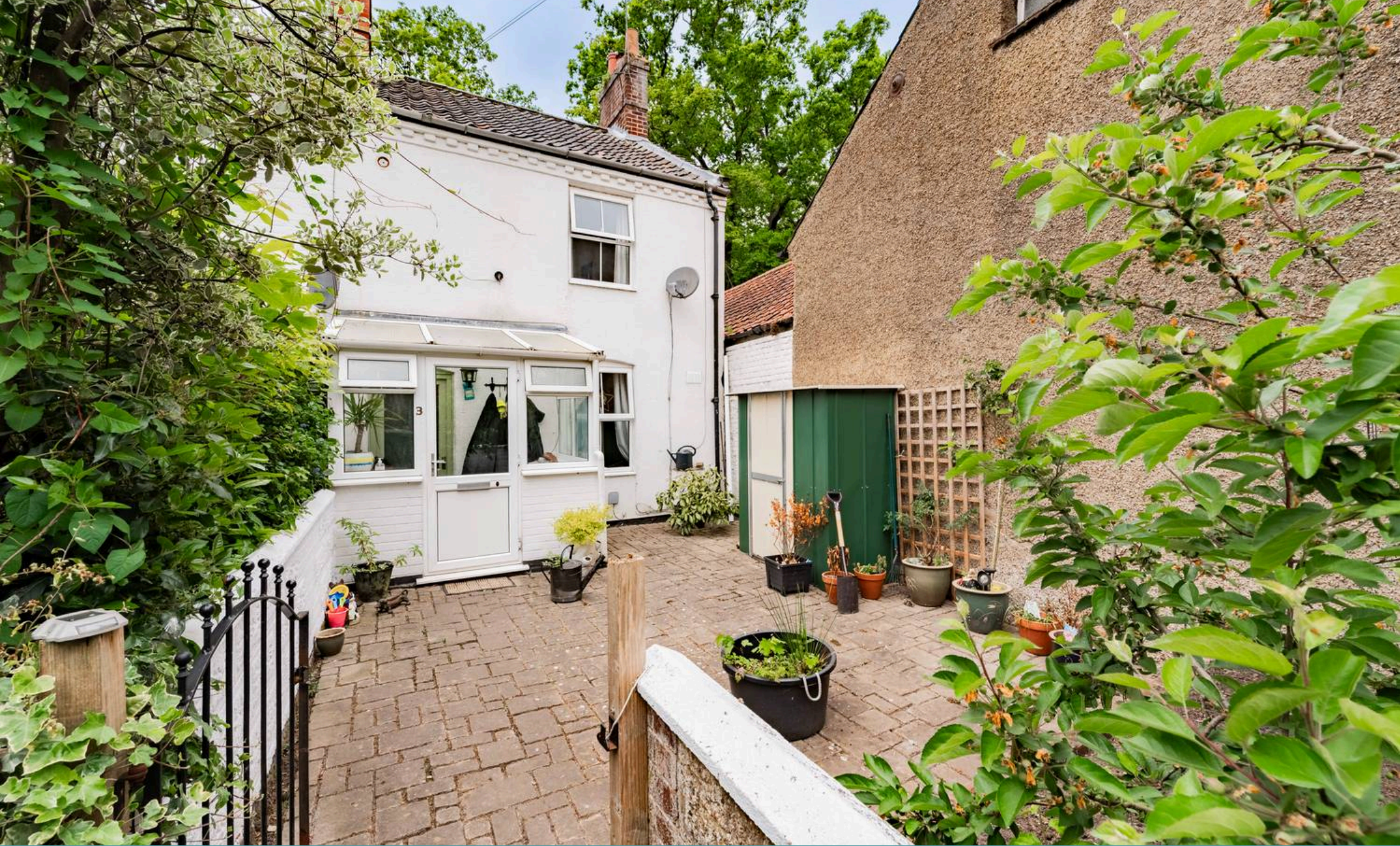
3 Lower Cottage Kings Arms Street, North Walsham £220,000