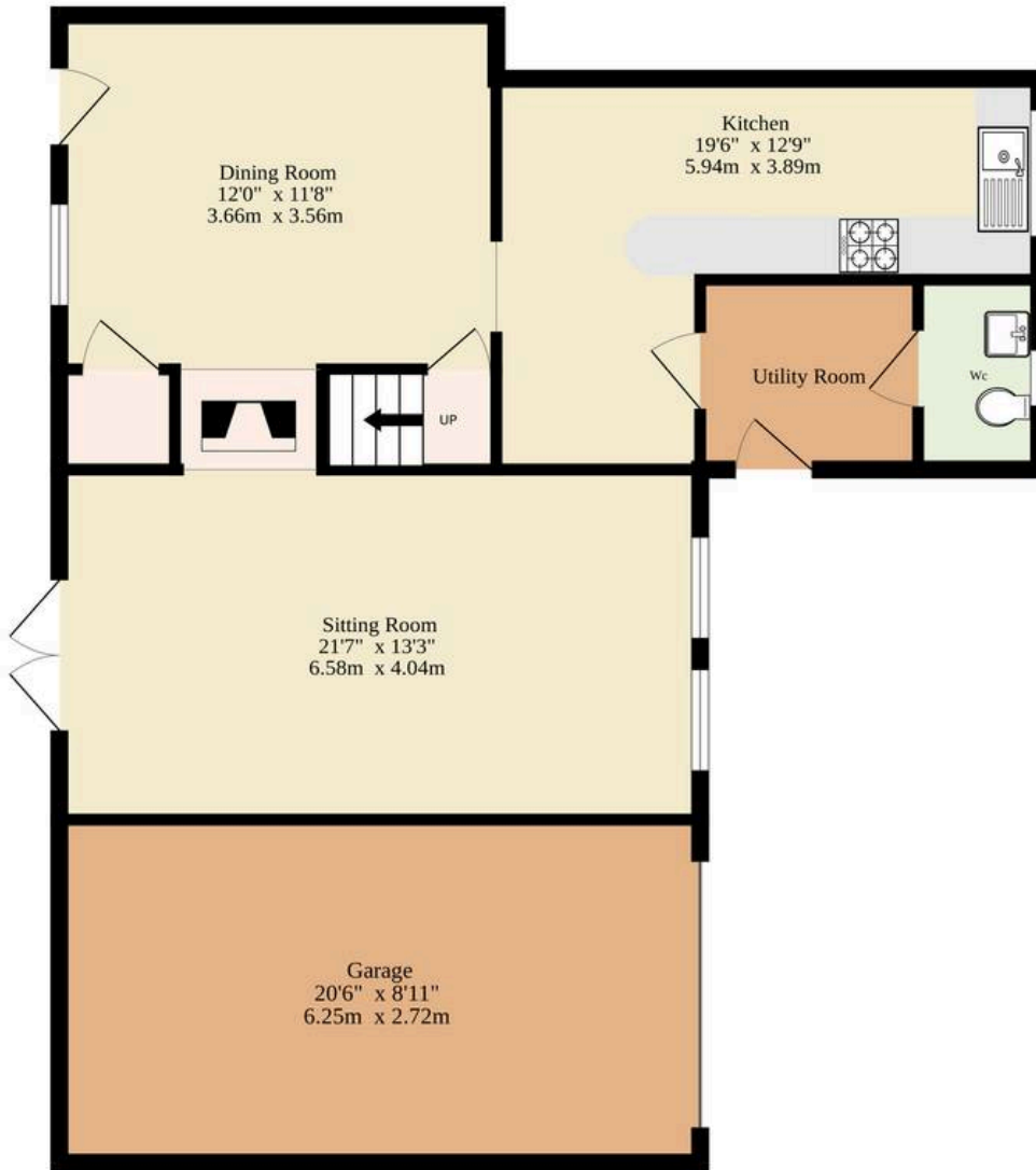
Ground Floor 916 sq.ft. (85.1 sq.m.) approx.