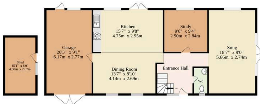
Ground Floor 924 sq.ft. (85.8 sq.m.) approx.