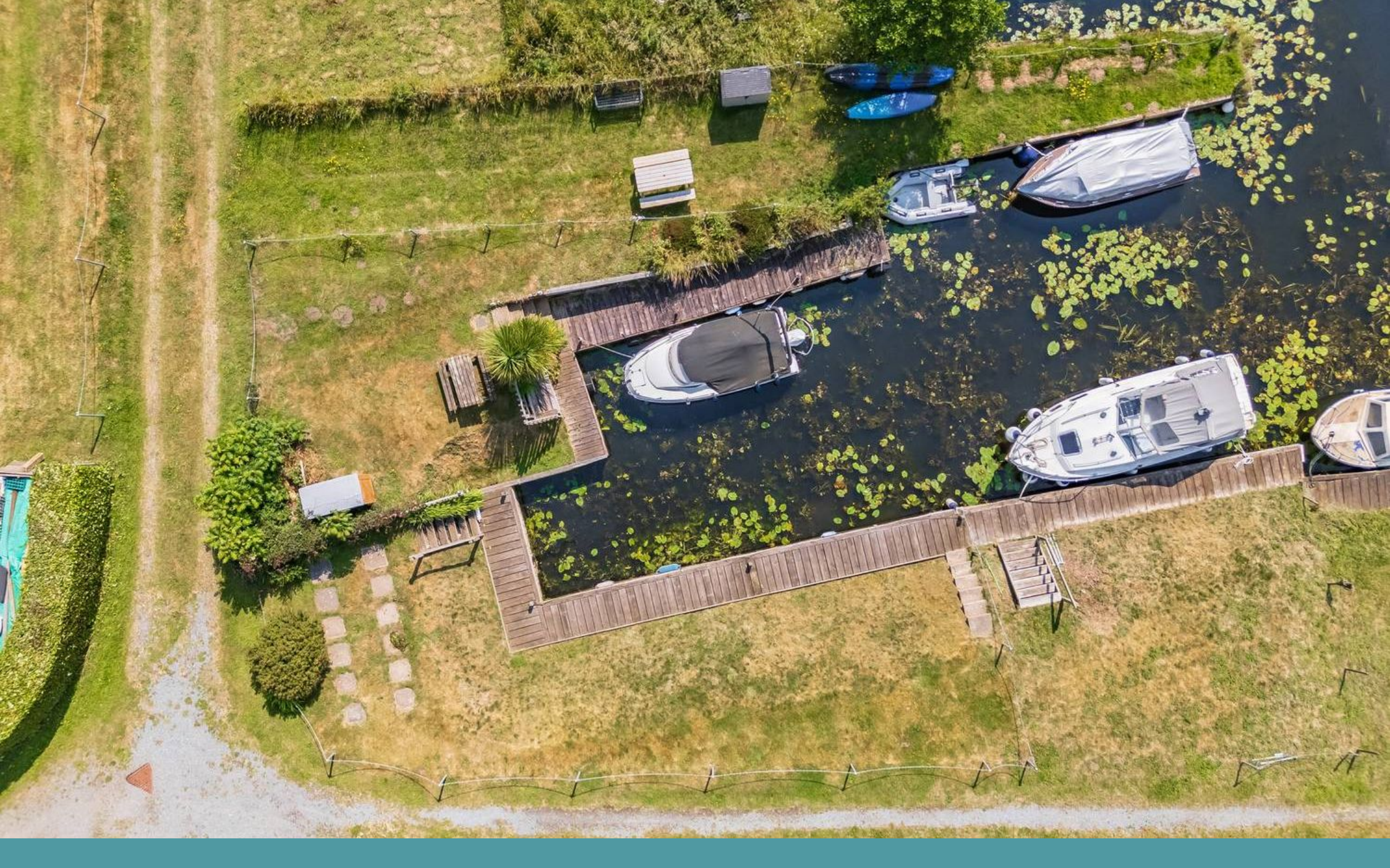
Plot 18, Tylers Dyke, The Street In Excess of £42,500