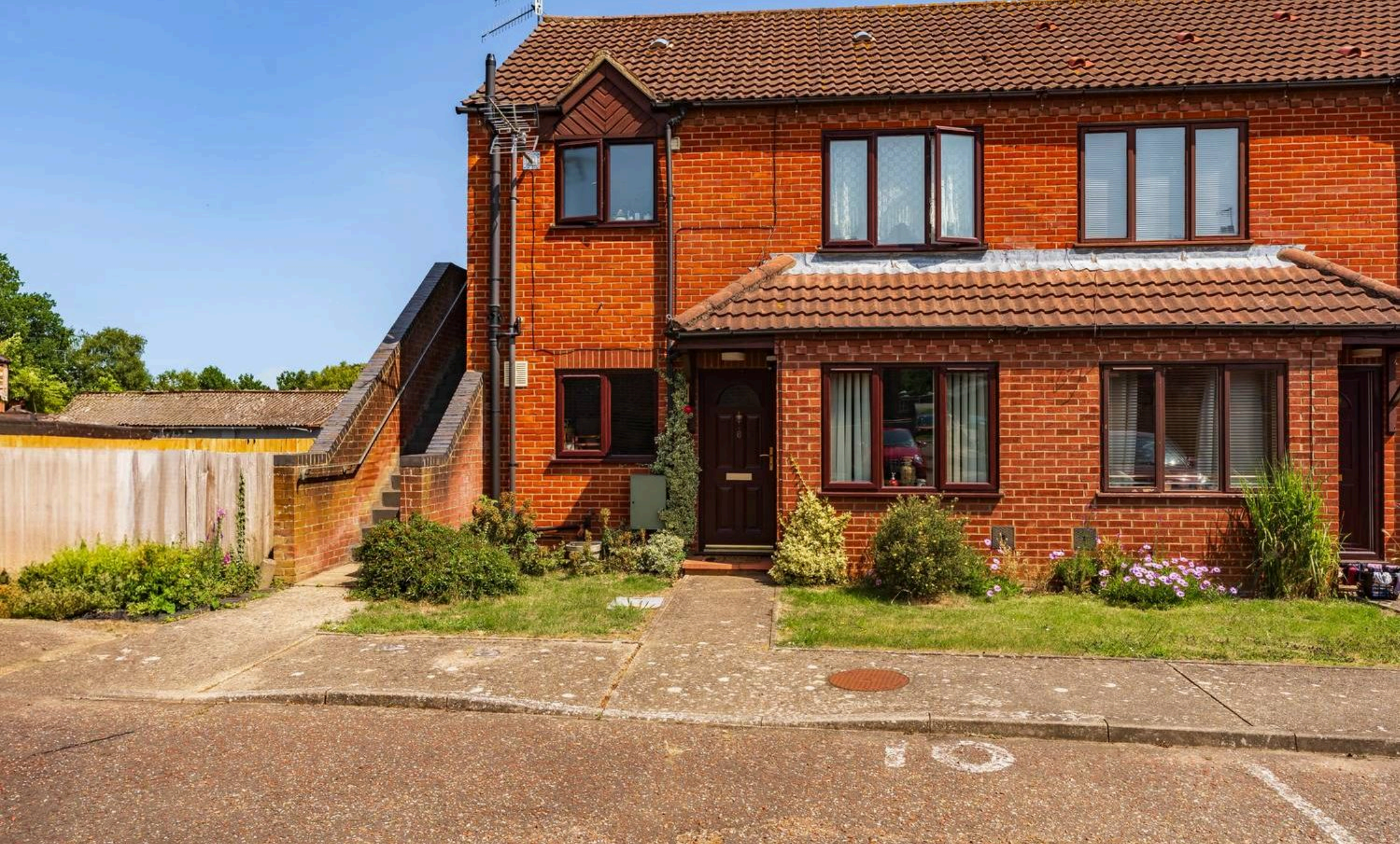
6 Pellew Place, North Walsham £155,000