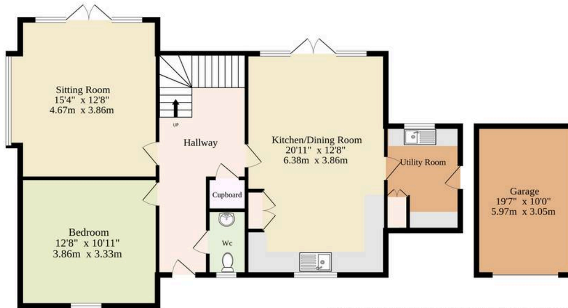
Ground Floor 1008 sq.ft. (93.6 sq.m.) approx.