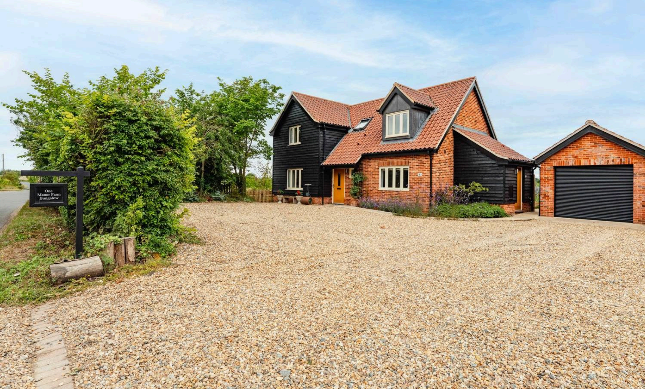
1 Manor Farm Bungalow Diss Road, Tibenham