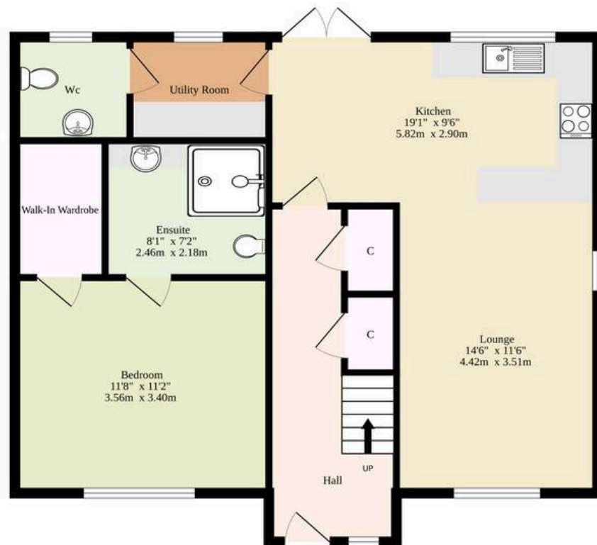
Ground Floor 817 sq.ft. (75.9 sq.m.) approx.