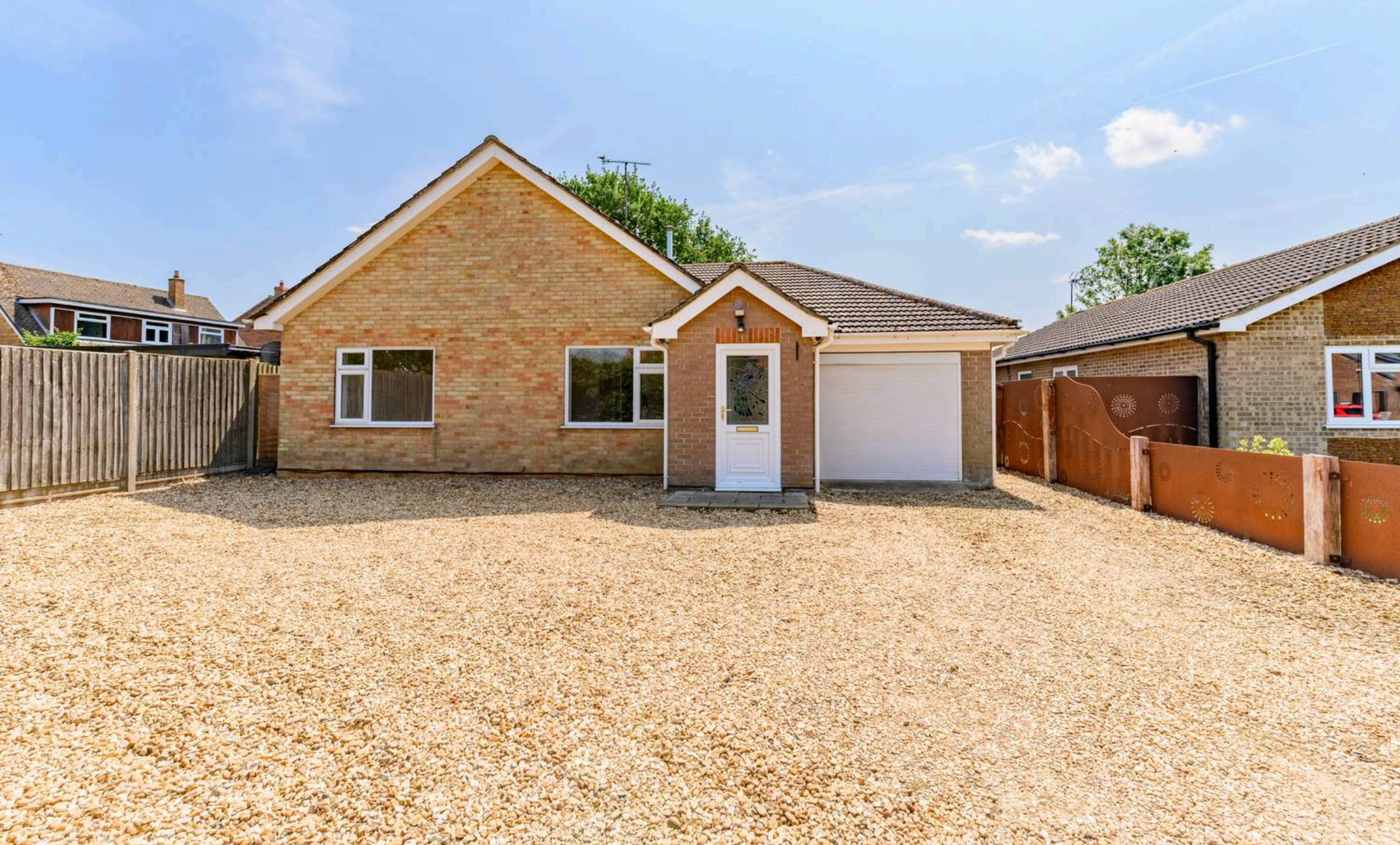
3 Birch Grove, West Winch £325,000