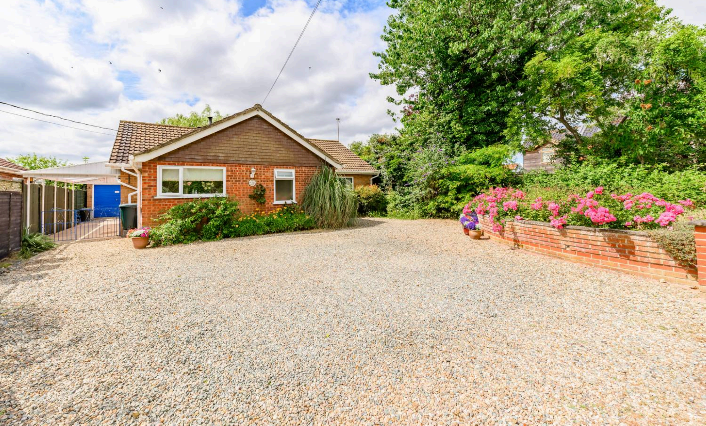
Petra Post Office Road, Little Plumstead £400,000