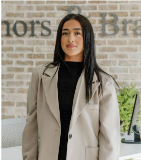
Meet Ayesgul Aftersales Progressor