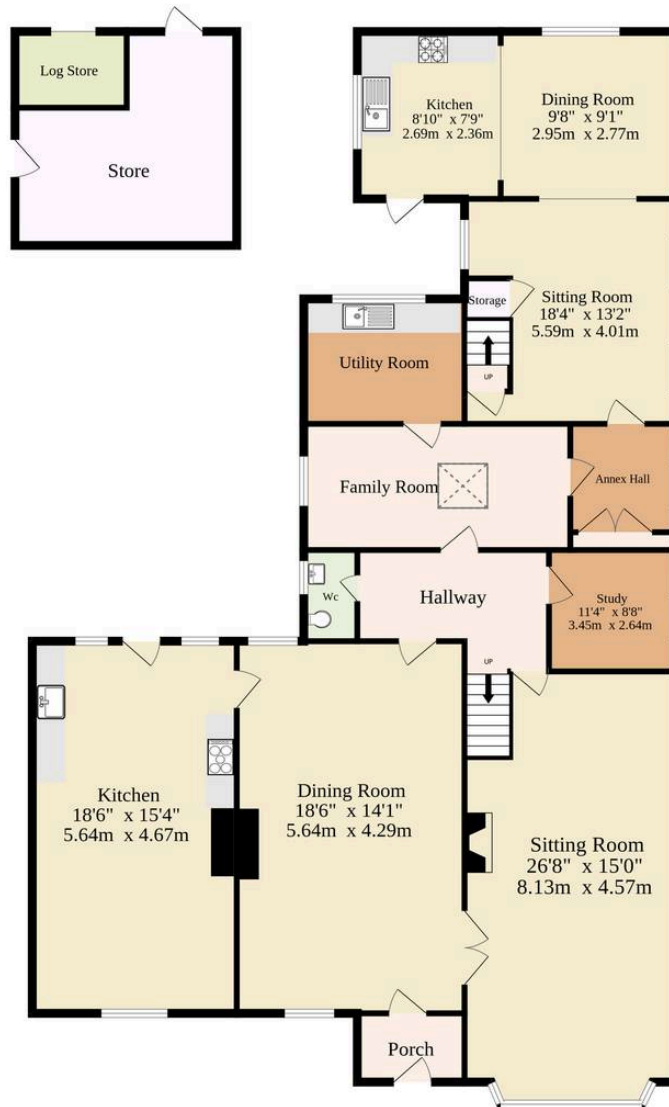
Ground Floor 2057 sq.ft. (191.1 sq.m.) approx.