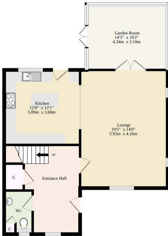
Ground Floor 739 sq.ft. (68.7 sq.m.) approx.