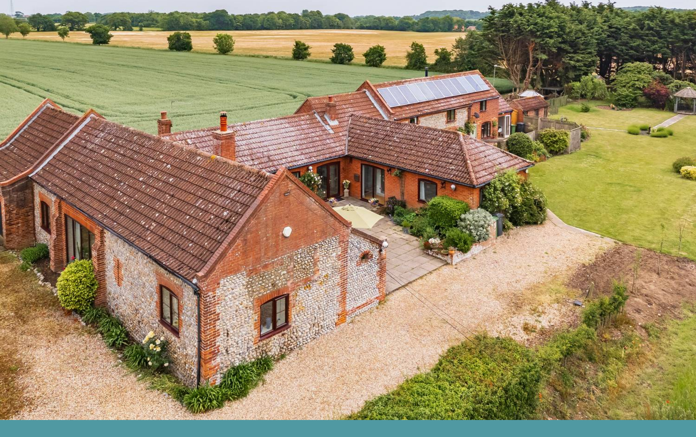
Heath Farm Cottage Paston Road, Paston