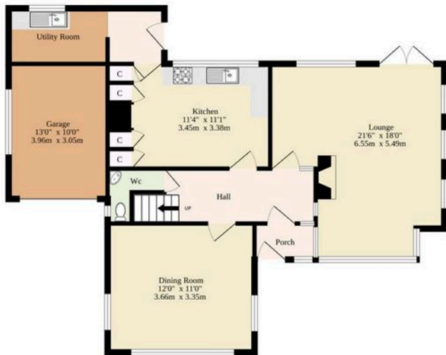
Ground Floor 1003 sq.ft. (93.2 sq.m.) approx.