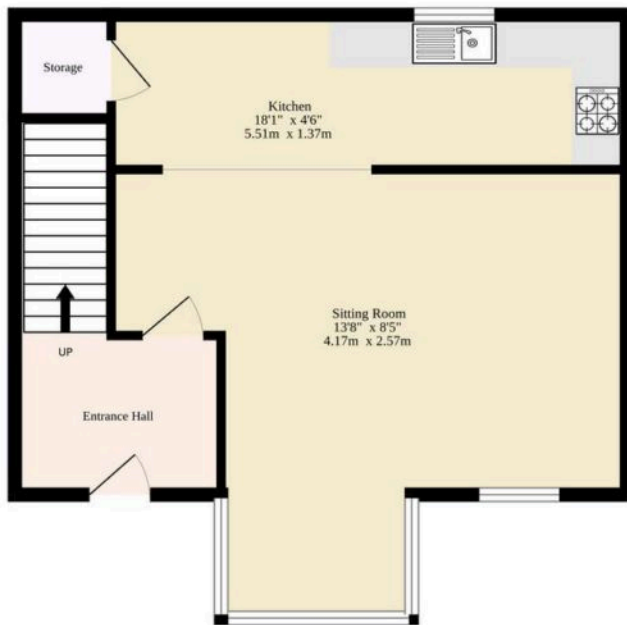
Ground Floor 249 sq.ft. (23.1 sq.m.) approx.