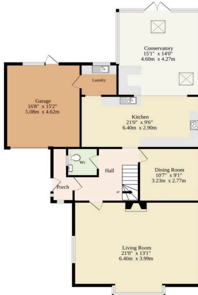
Ground Floor 1284 sq.ft. (119.3 sq.m.) approx.