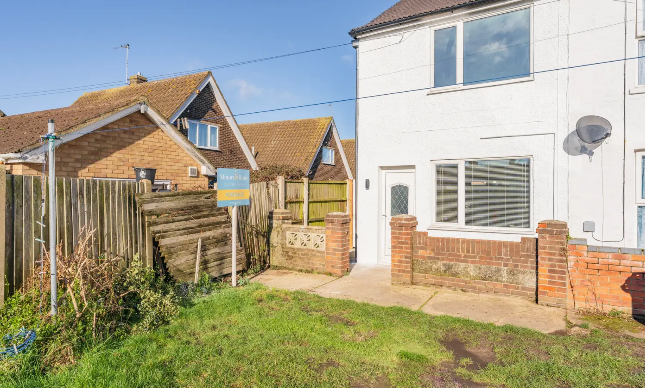
7 Victoria Street, Caister-On-Sea £180,000 - £190,000