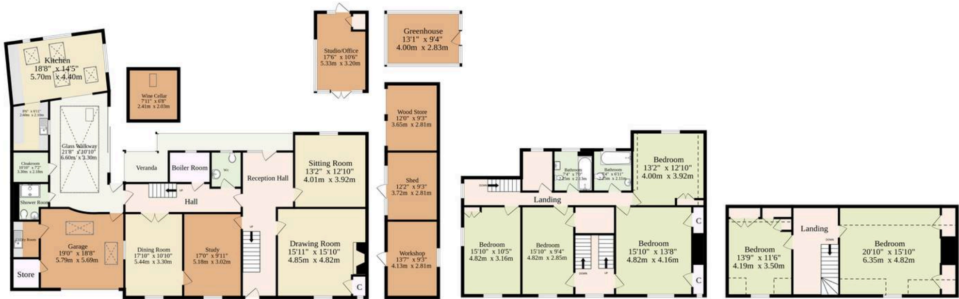
2nd Floor 629 sq.ft. (58.4 sq.m.) approx.

TOTAL FLOOR AREA : 4398 sq.ft. (408.5 sq.m.) approx.