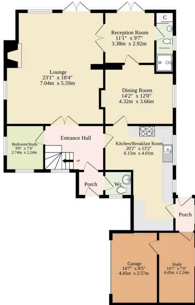
Ground Floor 1442 sq.ft. (134.0 sq.m.) approx.