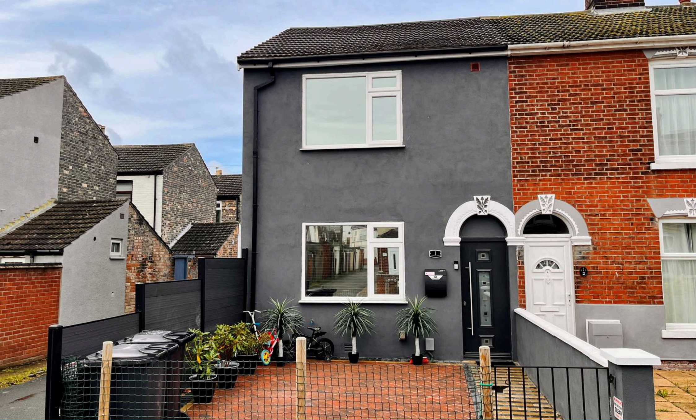
1 Churchill Road, Great Yarmouth