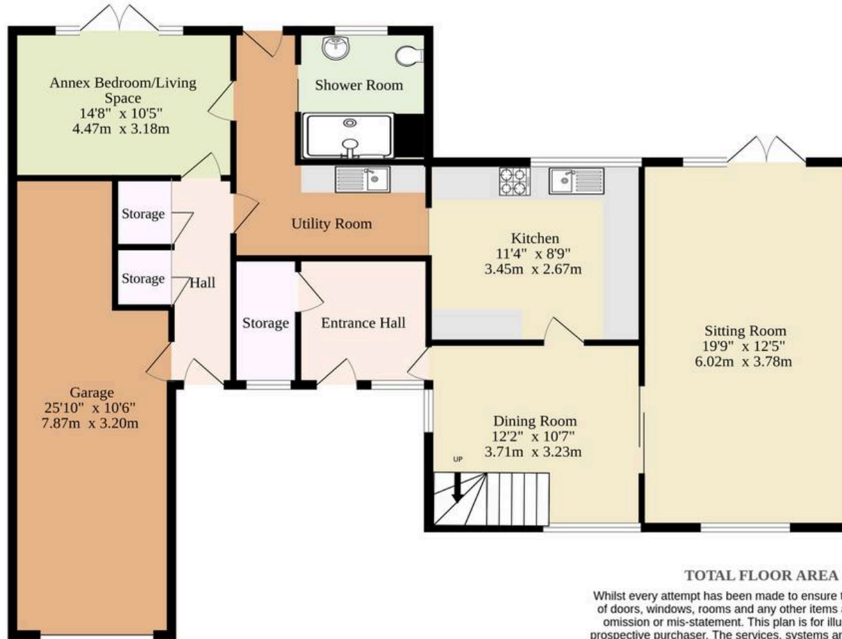
Ground Floor 1189 sq.ft. (110.5 sq.m.) approx.