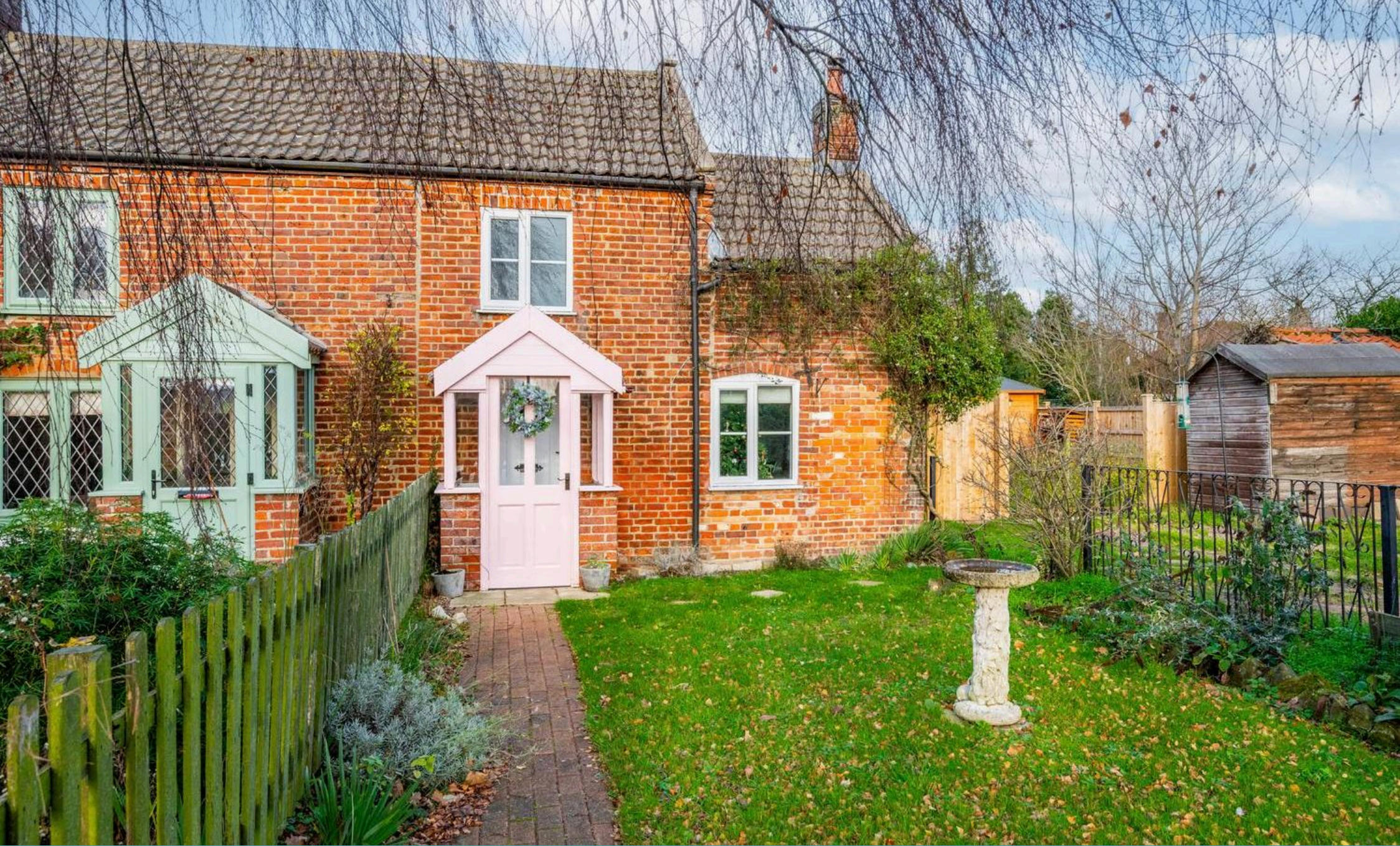
2 Cottages Main Road, Fleggburgh £295,000